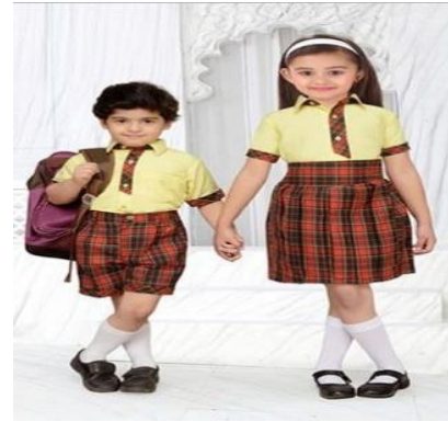
10) School Uniform