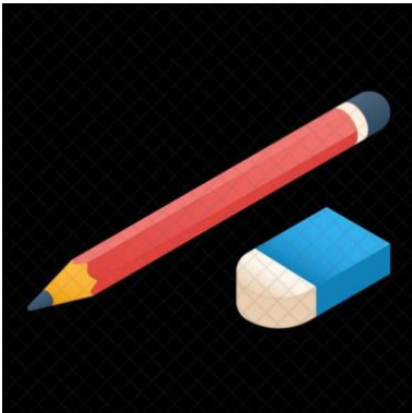
7)Pencil & Eraser