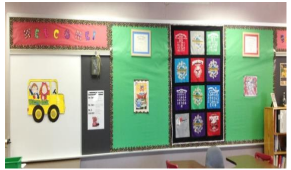
6) Pinup Board