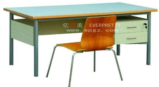
8) Teacher's Table & Chair