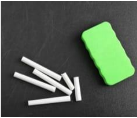
9) Chalk & Duster