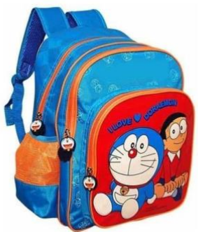
11) School Bag